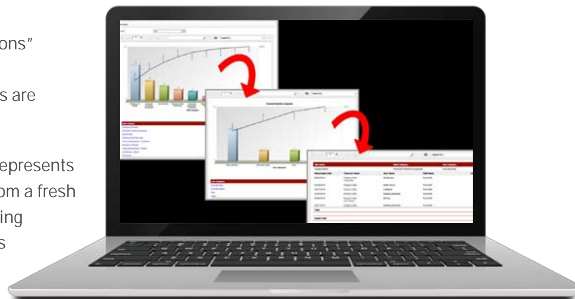
View a macro level report and drill down to the detail you need.